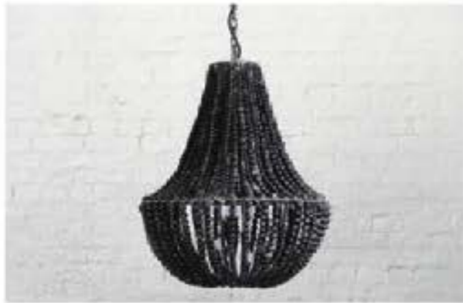
LIM clay beaded chandelier From $1,998 atelierlane.com