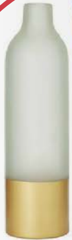
Amalfi Ruby vase $85 myposhbox.com.au