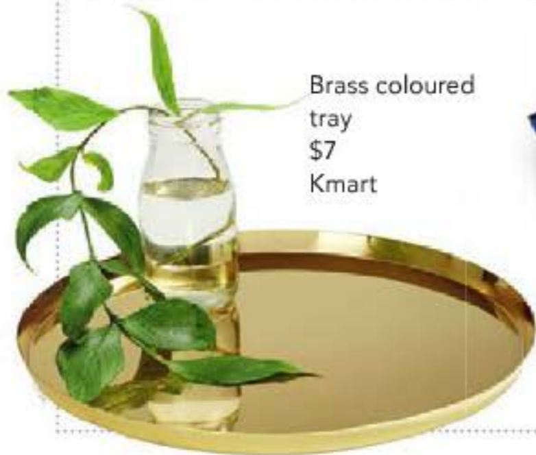
Brass coloured tray $7 Kmart

Jewel tones are the hot new trend with furniture and décor in rich muted colours such as burgundy, emerald green and plum, with luxurious materials such as plush velvet. According to Emma Blomfield from online homewares retailer TheHome.com.au, one simple way to adopt this trend is to add cushions to your sofa – navy is a great classic that can be added to most colour schemes. Fresh flowers can also be used to introduce the jewel toned theme.