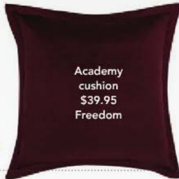
Academy cushion $39.95 Freedom