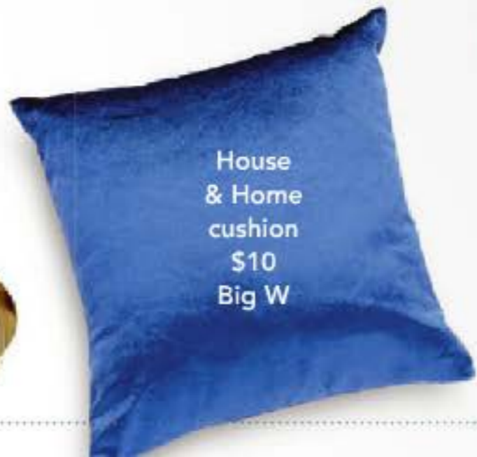
House & Home cushion $10 Big W