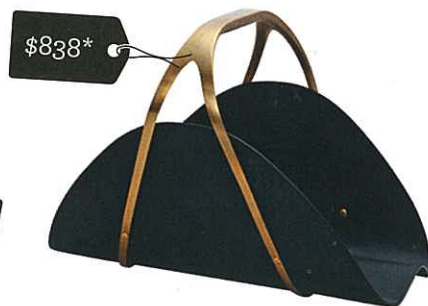
'Kanaya' leather and brass magazine rack in Black, $838* (USD$625), Promote Modern Design.