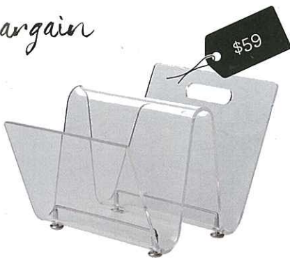
'Corzetti' acrylic magazine rack, $59, Nick Scali Online.