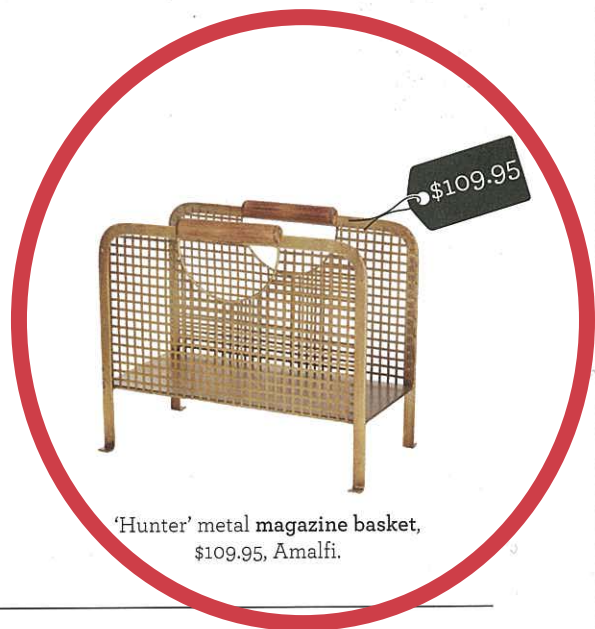
'Hunter' metal magazine basket, $109.95, Amalfi.