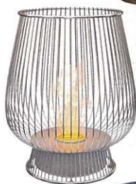
EcoSmart 'Bulb' fire burner, $895, coshiving.com.au.