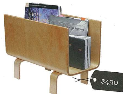
European beech magazine rack, $490, Workshopped. Stockists, page 252 >