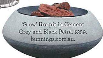
'Glow' fire pit in Cement Grey and Black Petra, $359, bunnings.com.au.