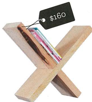
'Poppi' golden cypress magazine stand, $160, Harry & Jane.