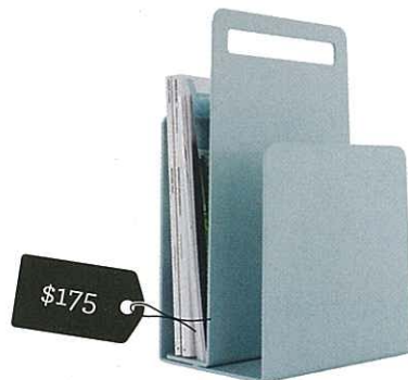
'Alfred' aluminium magazine rack in Blue, $175, DesignByThem.