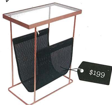
Copper side table + magazine rack, $199, The Minimalist.