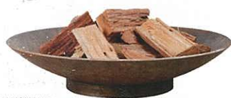
'Angelina' fire pit, $1100, robertplumb.com.au.

WE'VE PICKED OUR FAVOURITE OUTDOOR FIRE PITS TO ADD A BIT OF ENCHANTMENT - AND WARMTH - TO YOUR WINTER SOIREES.